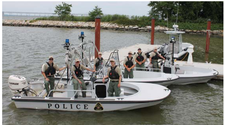
MD State Police heading out on patrol