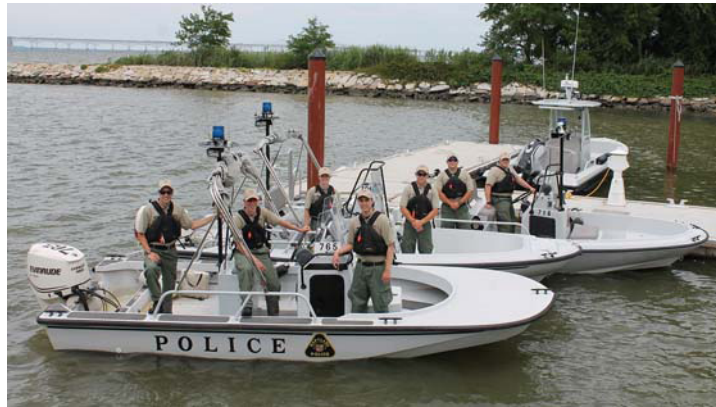
MD State Police heading out on patrol