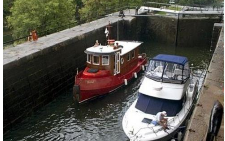
Learn how to navigate locks in the Boating seminar.

- Weather for Boaters – A boater's guide to forecasting, winds and storms