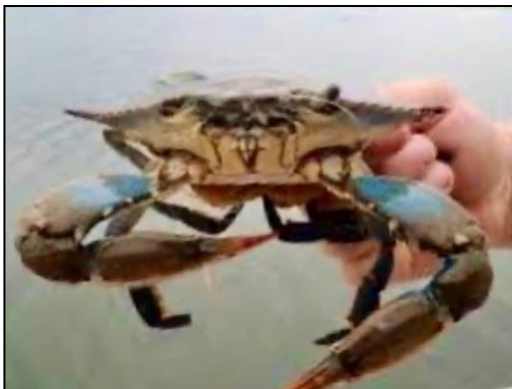
A solitary crab

Sunday morning, I was sure my luck would have changed, and sure enough when I pulled up the trap a single crab was inside.