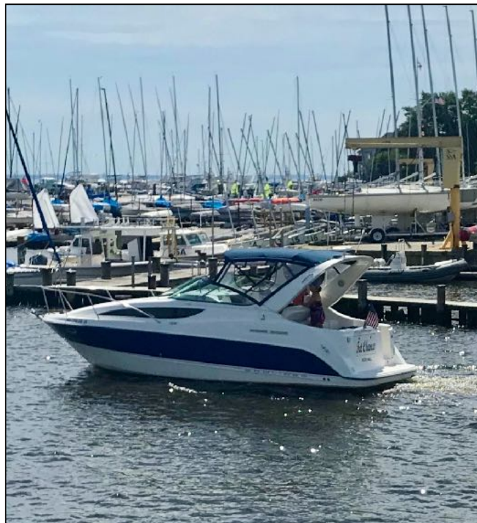
Fat Chance leaves Annapolis Harbor

Friday, after clear weather and calm seas all week, we departed for our home ports. Three boats left for Rock Hall and two to Bay Bridge